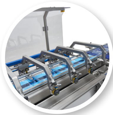
Optionally equipped with separation system