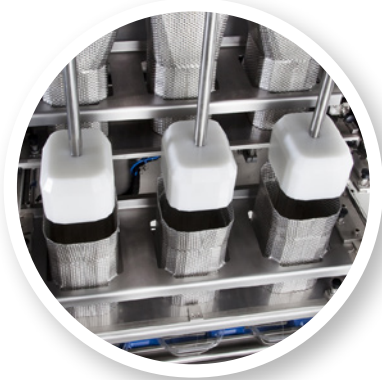
Option: integrated press units