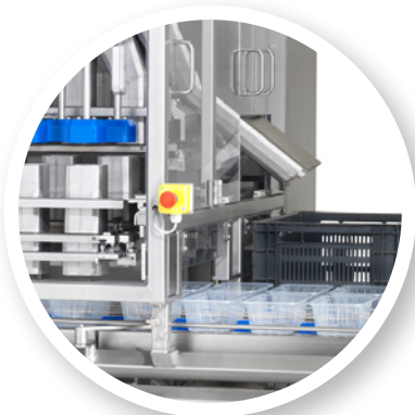
Funnel for discharge of rejected product