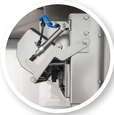
Camera in a moisture-free environment