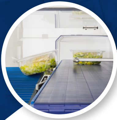
Automatic reject system for faulty products